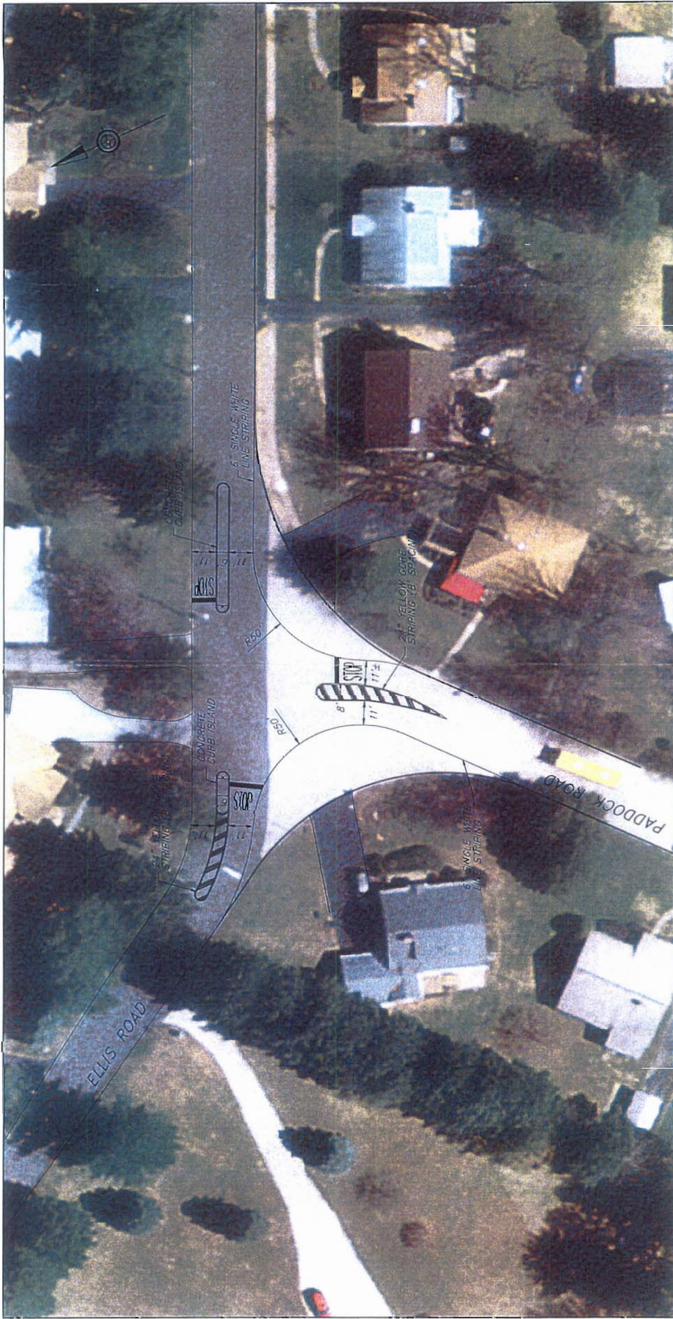
PLAN: ELLIS AND PADDOCK ROADS