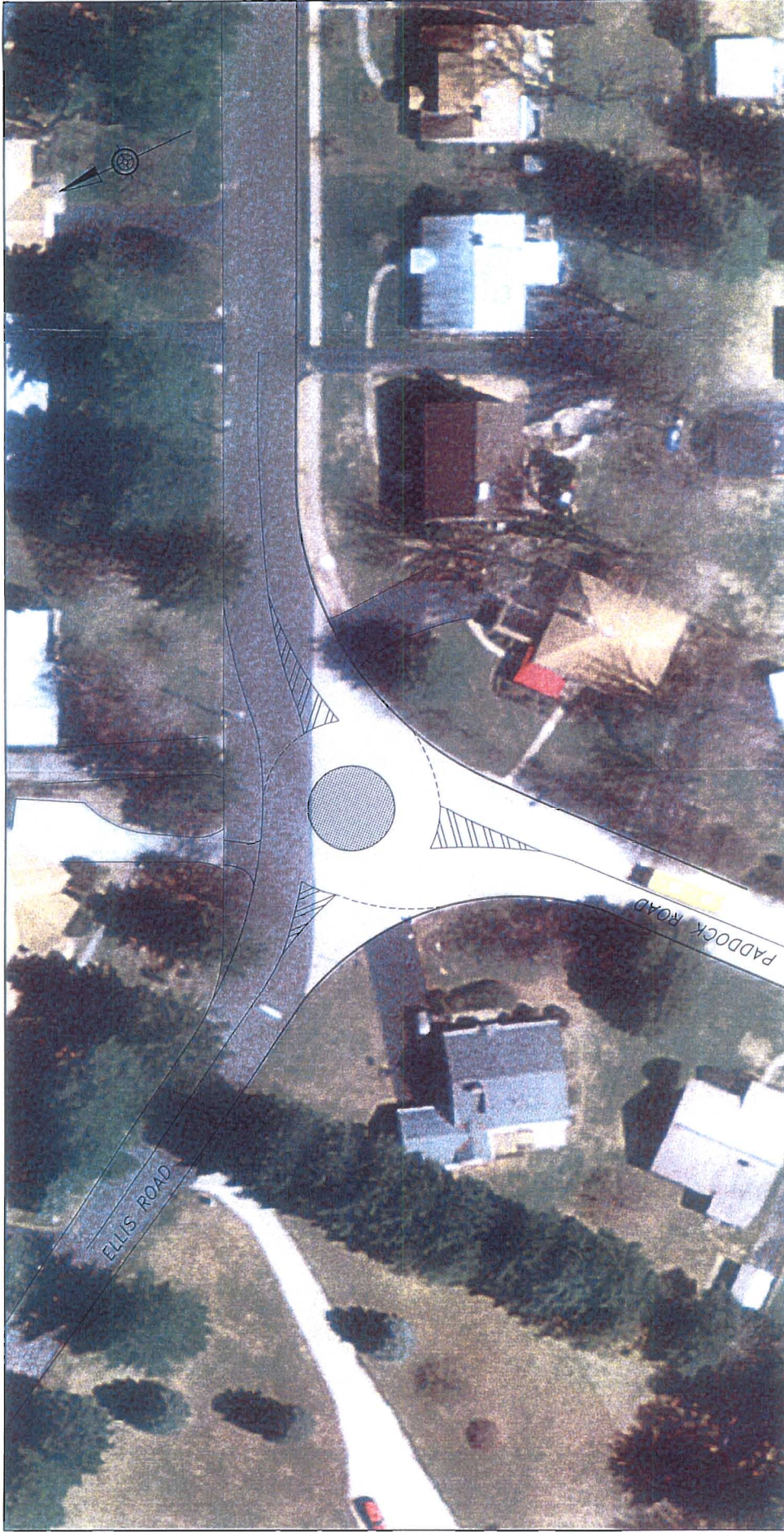
PLAN: ELLIS AND PADDOCK ROADS